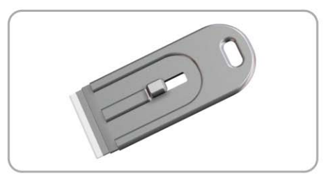
Scraper #213 Razor Blade Holder.