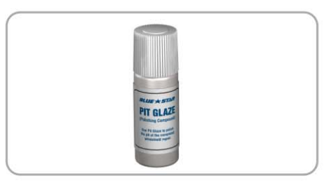
Pit polish #PP17 - 1 oz Pit Polish Compound with Brush Cap (for buffing break pit to a glass like luster). Pit polish #PP8 - 1/2 oz Pit Polish Compound with Brush Cap (for buffing break pit to a glass like luster).