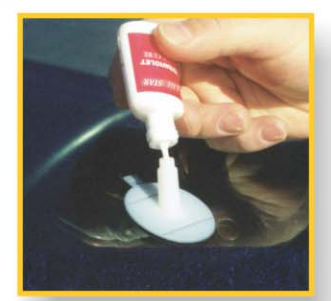
Dispense UV Resin directly into Resin Chamber.