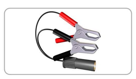
Battery Connector #BC

Replacement UV bulb for B80 & Shop Lamps (4 watt, 6 inches long).