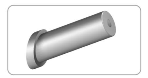
Cure Guard #CG

(Shields resin chamber & flow regulator from UV rays allowing repairs to be performed outdoors.)