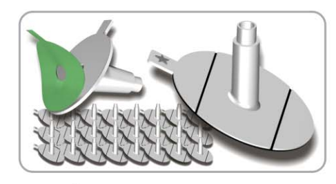
ClearVac<sup>™</sup> Resin Chambers #P6 25 Pedestal Resin Chambers for Clear Vac (Resin Chambers with Mounted Seals).