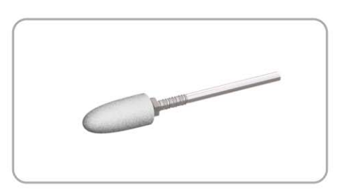
Mandrel & Polishing pad #226