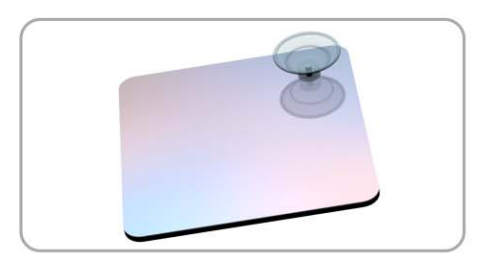
Viewing Mirror #VM Viewing Mirror.