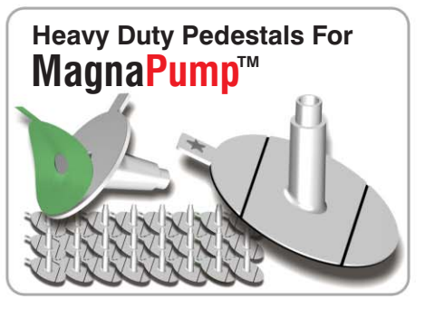
MagnaPump<sup>™</sup> Resin Chambers #PM6 25 Pedestal Resin Chamber for Magna Pump (Resin Chambers with Mounted Seals)