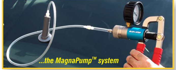
After attaching Hose and Injector Assembly, the system is ready to perform the Vacuum and Pressure cycle to complete the repair.