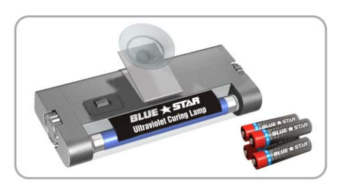
Portable UV Curing Lamp #B80

Flow Regulator (Controls Resin flow into Break Cavity).