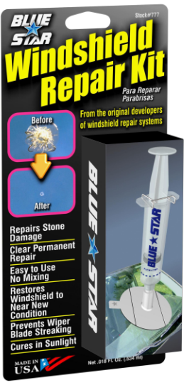
Stock #777 (front)