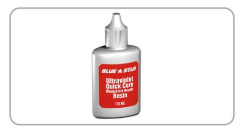
UV Quick Cure Resin #CH1 - 1 oz General Purpose Resin with Dispenser (Viscosity 60 cps). UV Quick Cure Resin #CH1/2 - 1/2 oz General Purpose Resin with Dispenser (Viscosity 60cps).

UV Crack Filler Resin #CCH1/2 - 1/2 oz Crack Resin with Dispenser (Viscosity 20 cps) Use for filling cracks and combination type breaks.