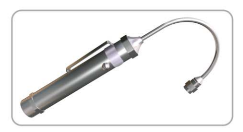
Pen Light #PLL

Clip with Suction Cup for mounting B80 Lamp to