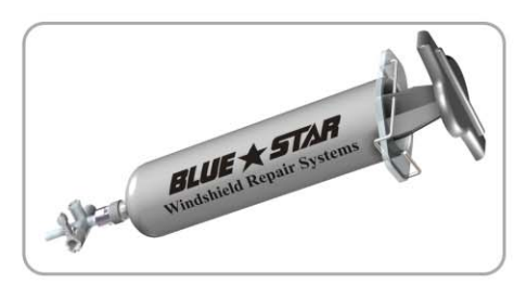
ClearVac<sup>™</sup> Injector Assembly #IBVM

The injector accumulates vacuum to 29.75 inches Hg. extracting the air pockets from the break cavity and applying pressure to the resin for penetration.