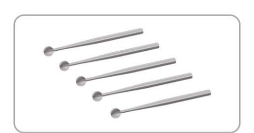
Glass Drill Bits #D5

12 Volt Drill (12,000 Rpm) with Cigarette Lighter connection and 2 drill bits.