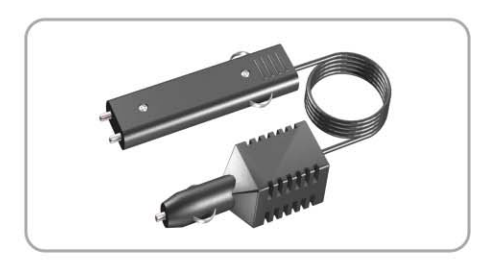
UV Lamp Adaptor #CL12V

Battery operated or use with UV Lamp Adaptor. Operates with 4 penlight batteries or with CL12V lamp adaptor. Attaches to glass with a suction cup clip.