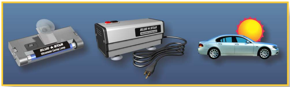
Remove the system and cure with your option of the battery powered UV lamp, 110 volt UV lamp or just the sun and you're done.

Both the MagnaPump™ and ClearVac™ utilize the same procedure to produce quality repairs