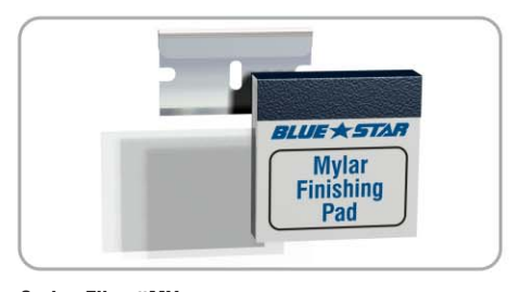
Curing Film #MY

Pad of 25 Mylar Curing Strips with 1 Razor Blade. (Use when curing the resin. It holds the resin in place, allows the UV rays to penetrate while blocking out the oxygen).