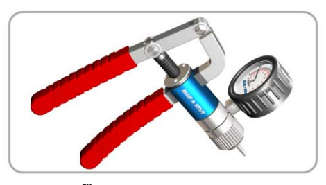
MagnaPump^{TM} Injector #MP

This deluxe system is made to accommodate businesses requiring equipment and supplies to handle higher volumes of windshield repair work and specialized glass services.