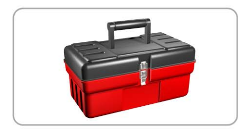
ClearVac Tool Box #TB Plastic Tool Box (17 X 8 X 9). Available free with kit.