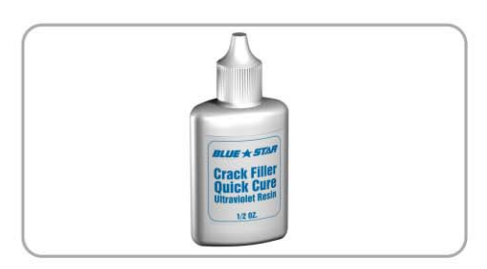
UV Crack Filler Resin #CCH1 - 1oz Crack Resin with Dispenser (Viscosity 20 cps) Use for filling cracks and combination type breaks.

UV Crack Filler Resin #CCH1/2 - 1/2 oz Crack Resin with Dispenser (Viscosity 20 cps) Use for filling cracks and combination type breaks.