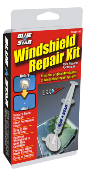
Stock #192 (front)